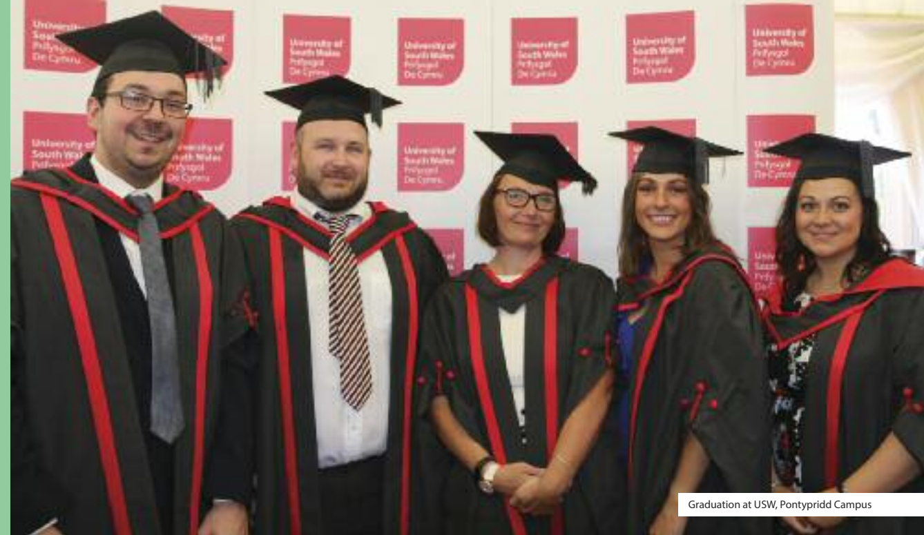
Graduation at USW, Pontypridd Campus