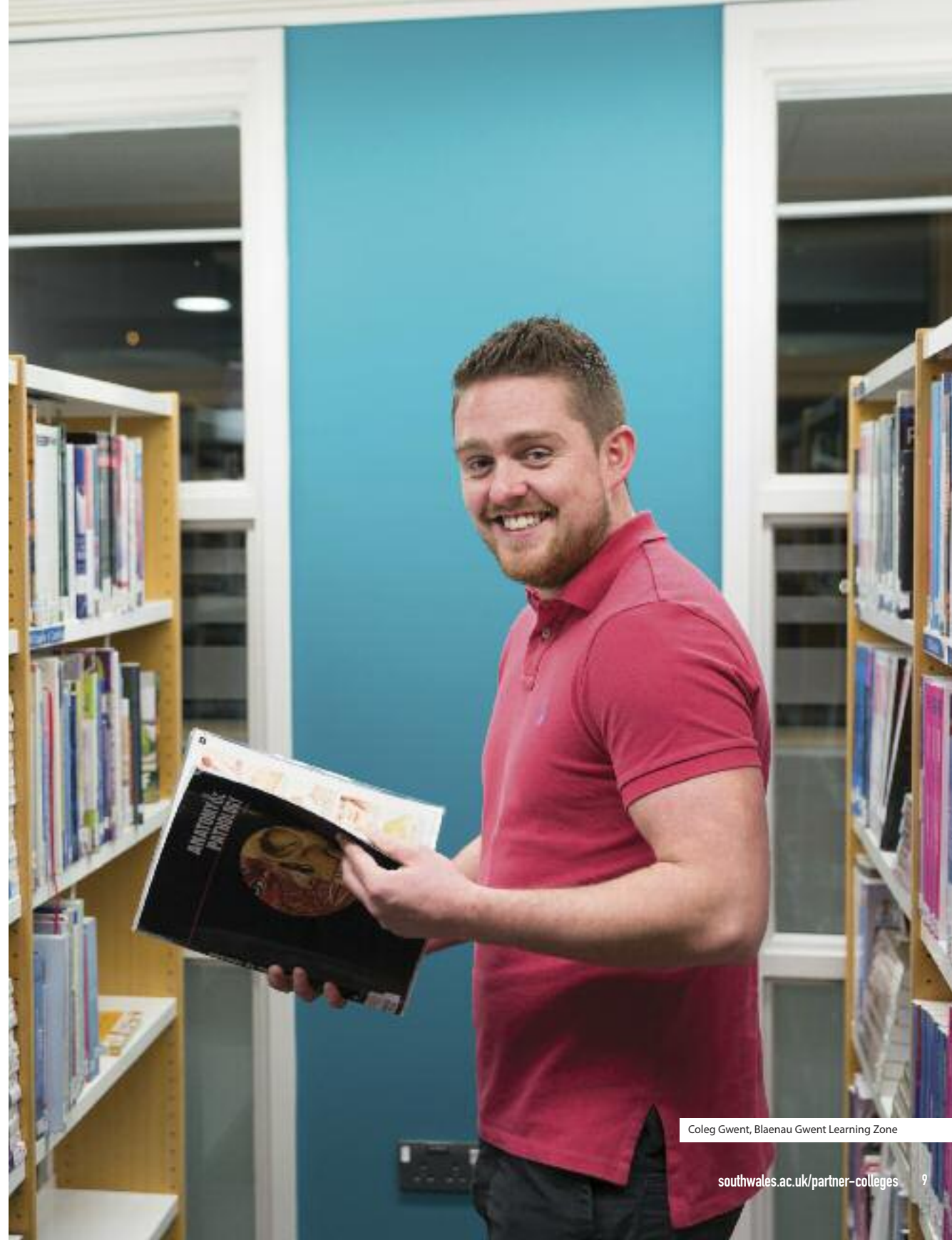
Coleg Gwent, Blaenau Gwent Learning Zone